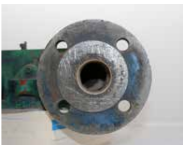
FLANGE FACE SURFACE PREPARED