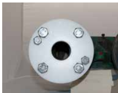
BELZONA AND FORMER APPLIED