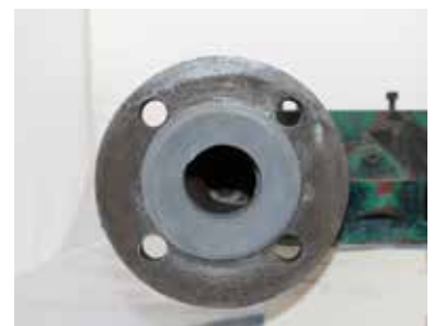
FORMER OFF, REFORMED FACE REVEALED