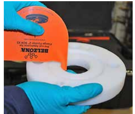
Flange Face Forming Kit applied